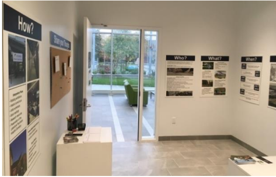
New exhibit space of the Lakeshore Grounds Interpretive Centre

The Lakeshore Grounds Interpretive Centre has moved into its exhibit space on Humber College's Lakeshore campus in Etobicoke. The new Centre aims to interpret the natural and built heritage of the Lakeshore Grounds through exhibits and cultural programming. The area has a rich history that spans indigenous, ecological, educational, and mental health themes.